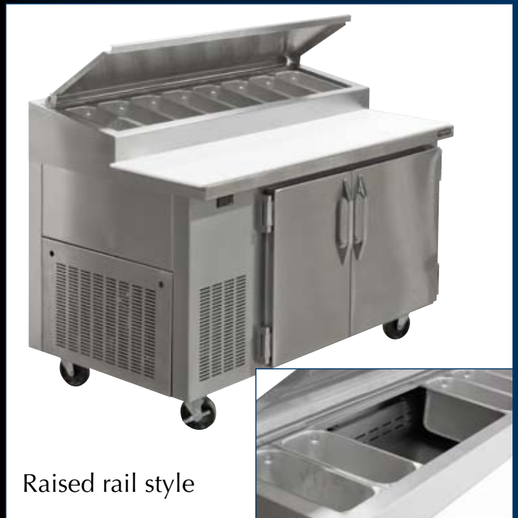
Raised rail style

Just one of the benefits of our complete in-house design, fabricating and manufacturing capabilities, is the fact that any of our Refrigerated Prep Tables can be tailored to fit your exact functional needs and interior décor preferences. Just let us know what you want, and our professional design staff will make it a reality.